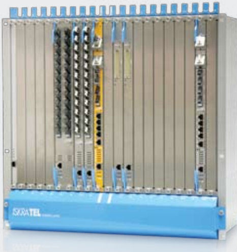
SI3000 LUMIA The high-performance access node

Every SI3000 Lumia node represents an integral IP entity in the operator's access network. Every node consists of a central blade, which acts as the node's brain and network connectivity interface, subscriber blades with end-user fiber or VDSL2 ports and the housing.